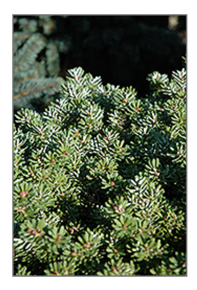
Silberperle Korean Fir foliage

361 N. Hunter Highway Drums, PA 18222 (570) 788-4181 www.beechwood-gardens.com