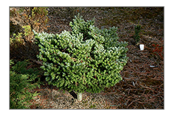
Silberperle Korean Fir

Silberperle Korean Fir is recommended for the following landscape applications;