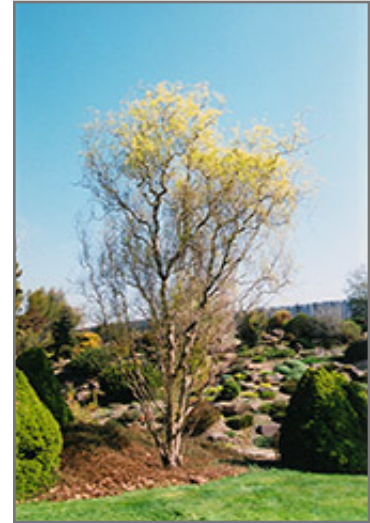
Dragon's Claw Willow in winter