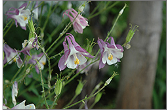
Common Columbine flowers