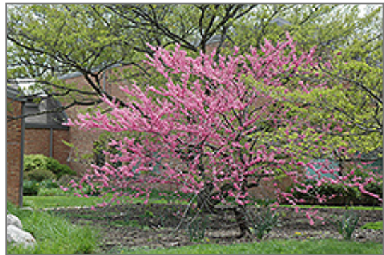
Wither's Pink Charm Redbud in bloom