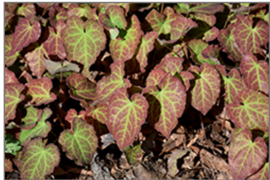
Froehnleiten Bishop's Hat foliage