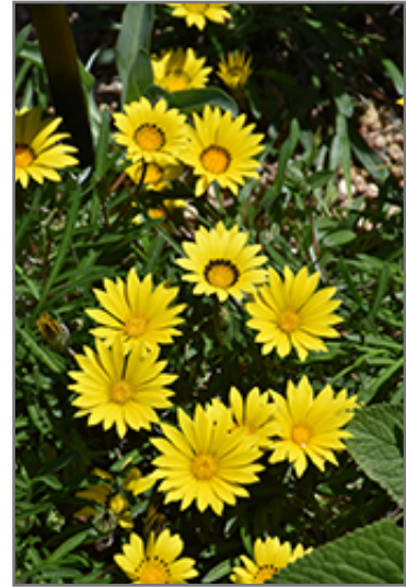
Colorado Gold Gazania flowers

Colorado Gold Gazania is recommended for the following landscape applications;