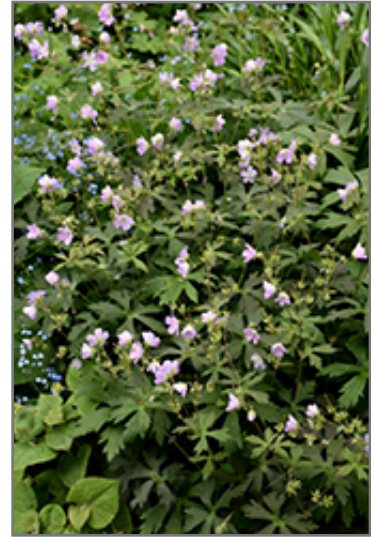
Espresso Cranesbill in bloom

Espresso Cranesbill will grow to be about 18 inches tall at maturity, with a spread of 24 inches. When grown in masses or used as a bedding plant, individual plants should be spaced approximately 20 inches apart. Its foliage tends to remain dense right to the ground, not requiring facer plants in front. It grows at a medium rate, and under ideal conditions can be expected to live for approximately 10 years. As an herbaceous perennial, this plant will usually die back to the crown each winter, and will regrow from the base each spring. Be careful not to disturb the crown in late winter when it may not be readily seen!