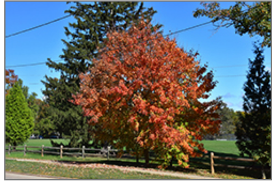
Ruby Frost Red Maple in fall