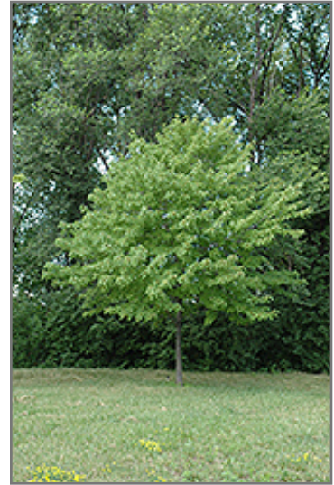
Ruby Frost Red Maple

This tree should only be grown in full sunlight. It is quite adaptable, preferring to grow in average to wet conditions, and will even tolerate some standing water. It is not particular as to soil type, but has a definite preference for acidic soils, and is subject to chlorosis (yellowing) of the foliage in alkaline soils. It is somewhat tolerant of urban pollution. This is a selection of a native North American species.