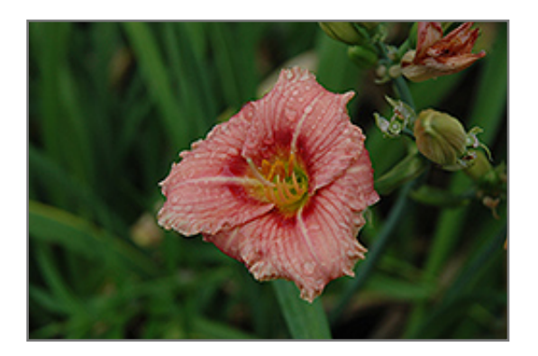
Siloam Bye Lo Daylily flowers

361 N. Hunter Highway Drums, PA 18222 (570) 788-4181 www.beechwood-gardens.com