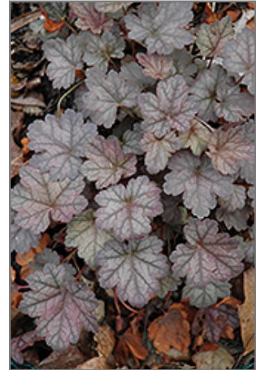
Dolce Mocha Mint Coral Bells foliage

Dolce Mocha Mint Coral Bells is recommended for the following landscape applications;