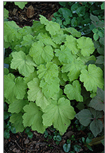
Pistache Coral Bells