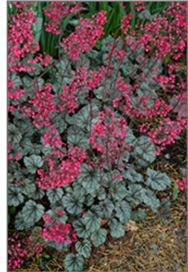
Rave On Coral Bells in bloom

Rave On Coral Bells is recommended for the following landscape applications;