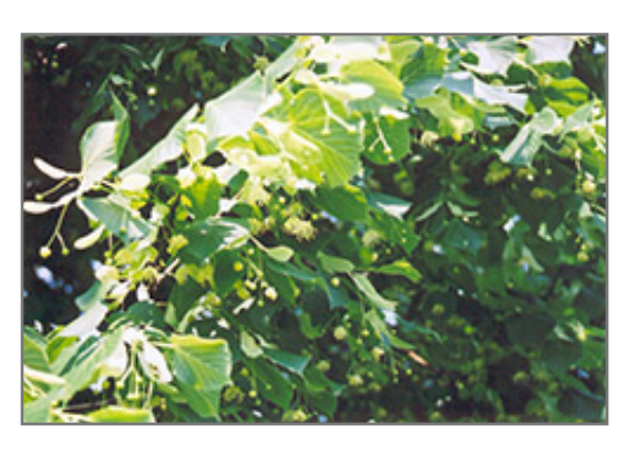
Littleleaf Linden flowers