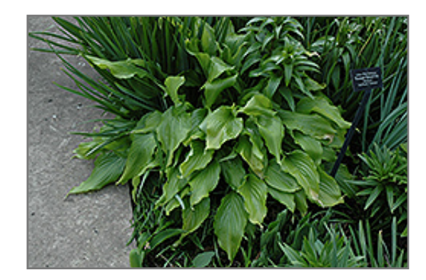
Green Fountain Hosta foliage