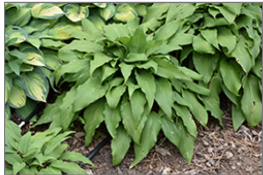
Red October Hosta