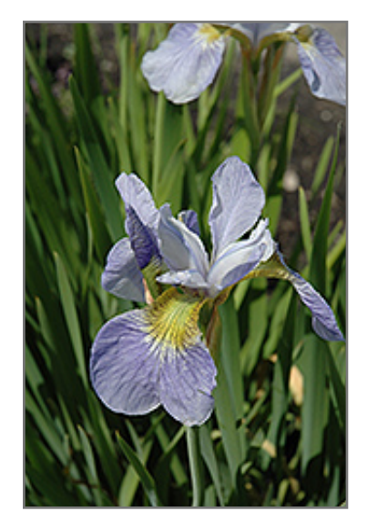
Sky Wings Siberian Iris flowers