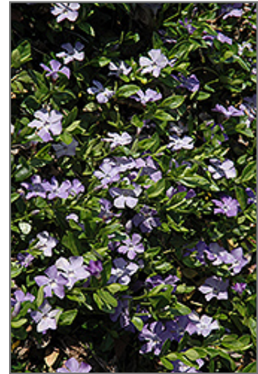
Common Periwinkle in bloom