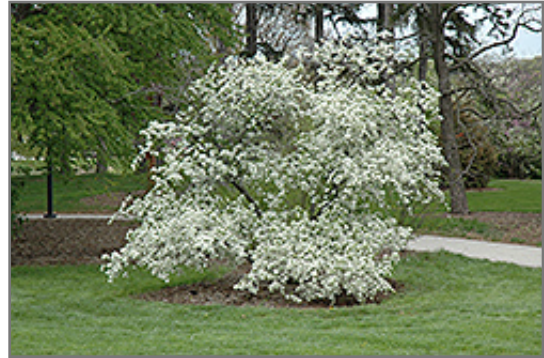
Fauriei Pear in bloom

Fauriei Pear will grow to be about 25 feet tall at maturity, with a spread of 20 feet. It has a low canopy with a typical clearance of 3 feet from the ground, and is suitable for planting under power lines. It grows at a medium rate, and under ideal conditions can be expected to live for 50 years or more.