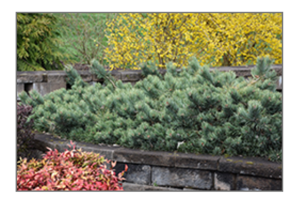
Albyn Prostrate Scotch Pine