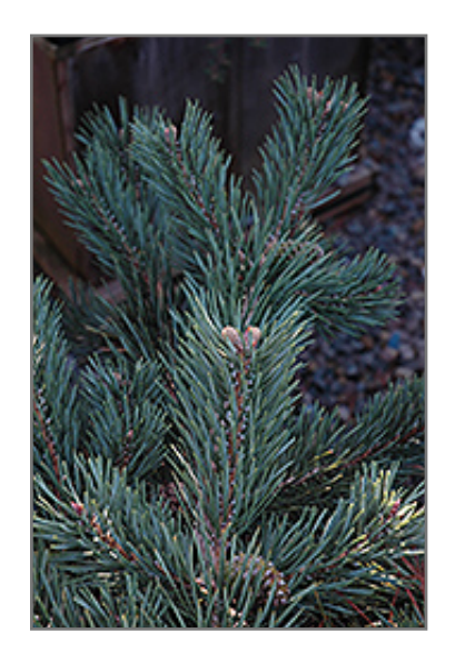
Albyn Prostrate Scotch Pine foliage