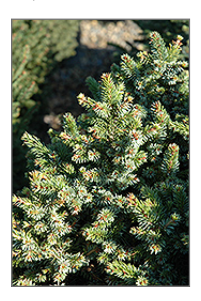
Pimoko Spruce foliage