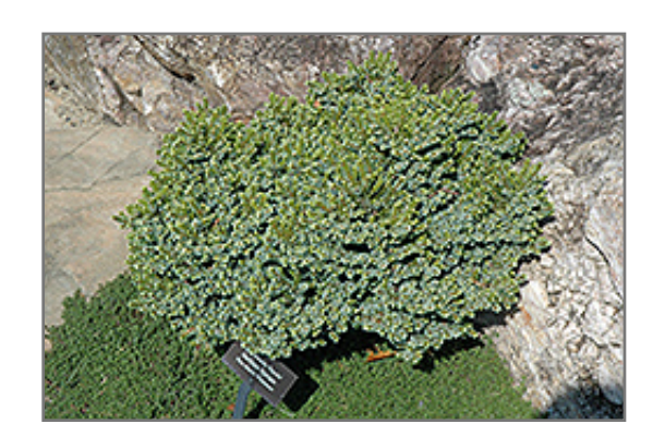
Pimoko Spruce