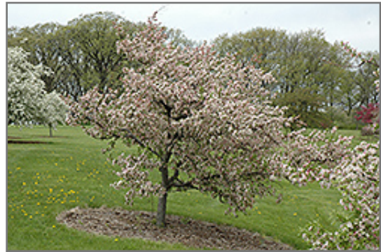
Leprechaun Flowering Crab in bloom