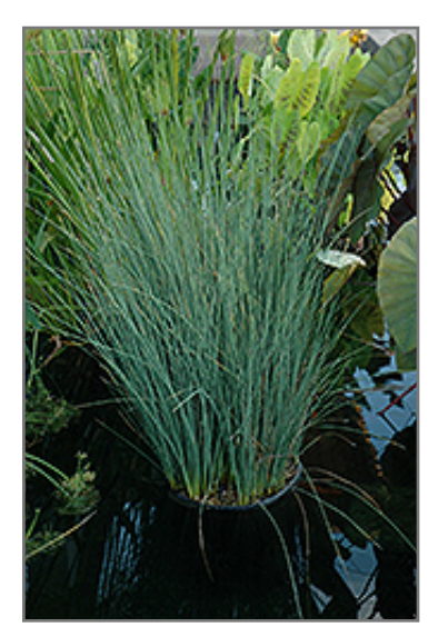
Blue Arrows Rush

* This is a 'special order' plant - contact store for details