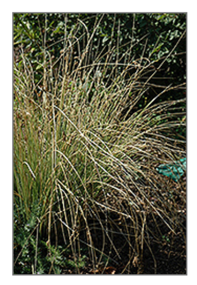
Blue Arrows Rush foliage

361 N. Hunter Highway Drums, PA 18222 (570) 788-4181 www.beechwood-gardens.com