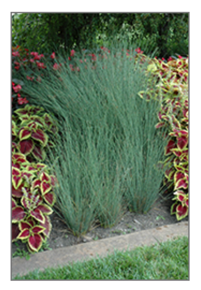
Blue Arrows Rush