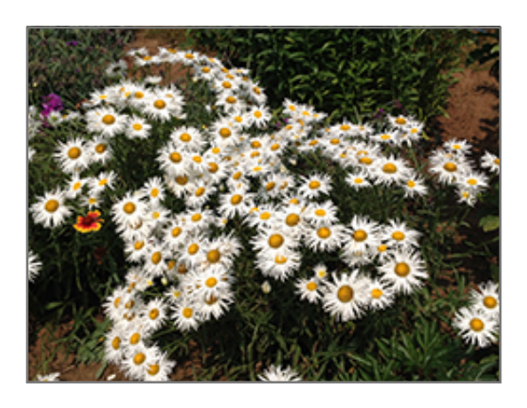
Crazy Daisy Shasta Daisy in bloom