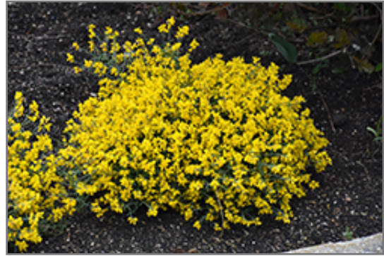
Bangle Dyers Greenwood in bloom