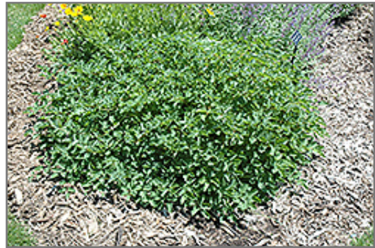
Japanese Bottlebrush