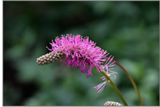
Japanese Bottlebrush flowers

Japanese Bottlebrush is recommended for the following landscape applications;