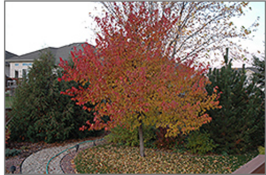
Embers Amur Maple in fall