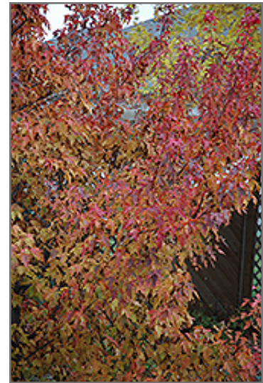
Embers Amur Maple in fall