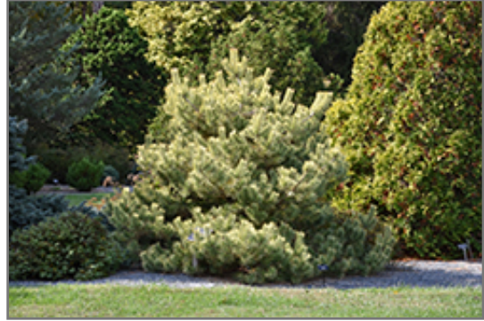
Gold Coin Scotch Pine

Gold Coin Scotch Pine will grow to be about 20 feet tall at maturity, with a spread of 15 feet. It has a low canopy with a typical clearance of 1 foot from the ground, and is suitable for planting under power lines. It grows at a medium rate, and under ideal conditions can be expected to live for 60 years or more.