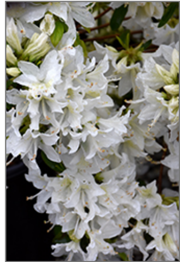
Cascade Azalea flowers