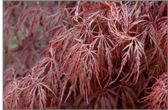
Crimson Queen Japanese Maple foliage

Crimson Queen Japanese Maple is recommended for the following landscape applications;