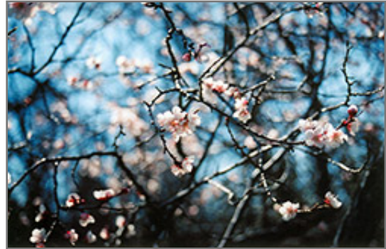
M604 Apricot flowers

M604 Apricot is blanketed in stunning clusters of fragrant shell pink flowers along the branches in early spring, which emerge from distinctive pink flower buds before the leaves. It has green deciduous foliage. The pointy leaves turn yellow in fall. The fruits are showy yellow drupes with gold overtones, which are carried in abundance in late summer. The fruit can be messy if allowed to drop on the lawn or walkways, and may require occasional clean-up.