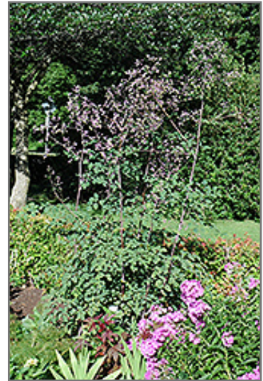
Rochebrun Meadow Rue in bloom