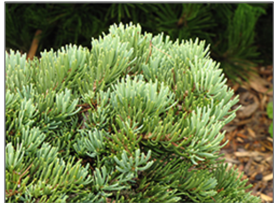
Masonic Broom White Fir foliage