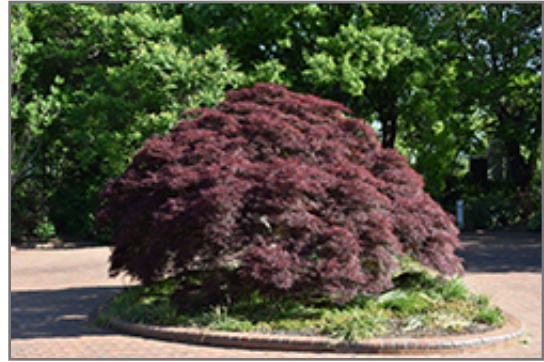
Purple-Leaf Threadleaf Japanese Maple

Purple-Leaf Threadleaf Japanese Maple is recommended for the following landscape applications;