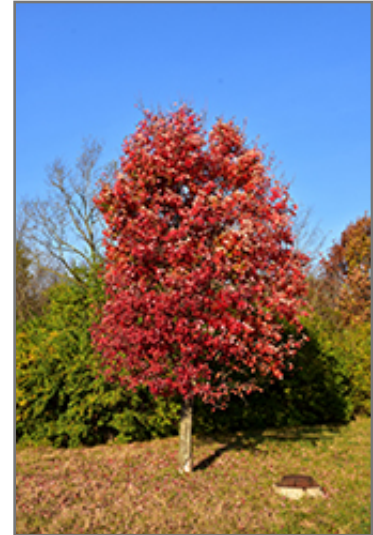
Autumn Flame Red Maple in fall