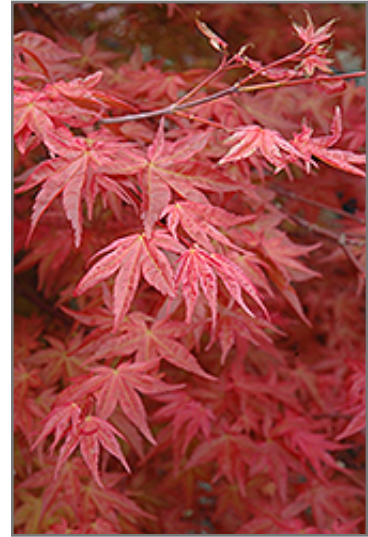
Suminagashi Japanese Maple foliage

This tree does best in full sun to partial shade. You may want to keep it away from hot, dry locations that receive direct afternoon sun or which get reflected sunlight, such as against the south side of a white wall. It prefers to grow in average to moist conditions, and shouldn't be allowed to dry out. It is not particular as to soil pH, but grows best in rich soils. It is somewhat tolerant of urban pollution, and will benefit from being planted in a relatively sheltered location. Consider applying a thick mulch around the root zone in winter to protect it in exposed locations or colder microclimates. This is a selected variety of a species not originally from North America.