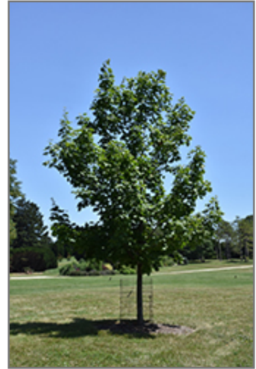
Crescendo Sugar Maple

* This is a 'special order' plant - contact store for details