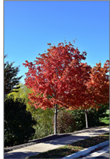
Crescendo Sugar Maple in fall