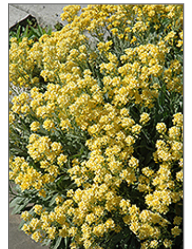
Dudley Neville Variegated Basket of