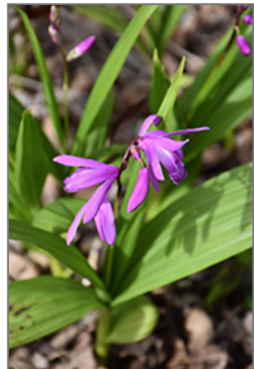
Lavender Japanese Hyacinth Orchid flowers