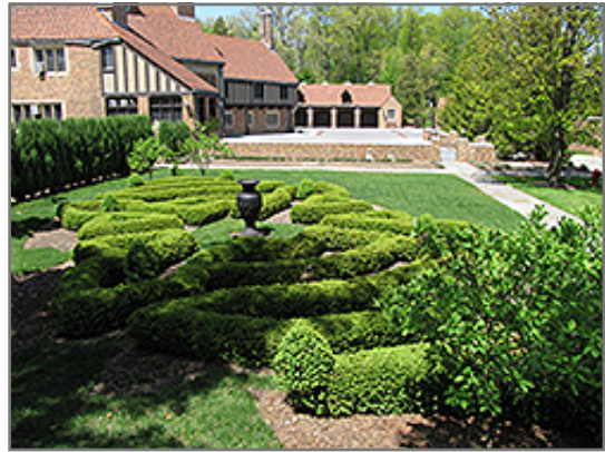
Compact Korean Boxwood

Compact Korean Boxwood will grow to be about 12 inches tall at maturity, with a spread of 12 inches. It tends to fill out right to the ground and therefore doesn't necessarily require facer plants in front. It grows at a slow rate, and under ideal conditions can be expected to live for approximately 30 years.