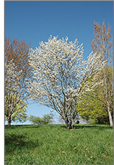
Princess Diana Serviceberry in bloom