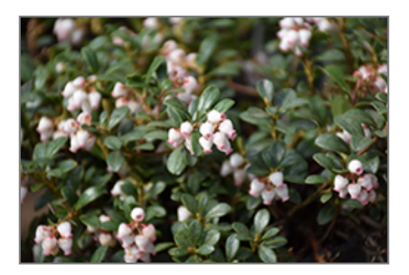
Massachusetts Bearberry flowers

361 N. Hunter Highway Drums, PA 18222 (570) 788-4181 www.beechwood-gardens.com