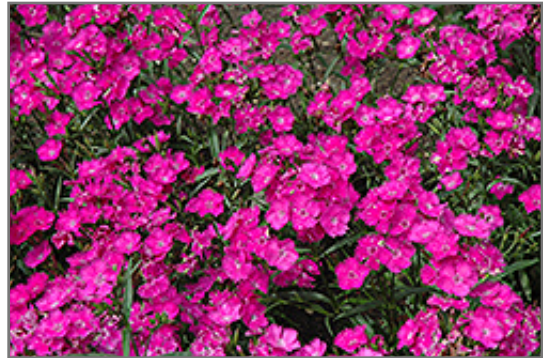
Bouquet Purple Pinks in bloom