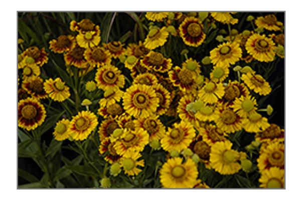
Gold Selection Sneezeweed flowers

361 N. Hunter Highway Drums, PA 18222 (570) 788-4181 www.beechwood-gardens.com