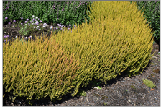
Firefly Heather

* This is a 'special order' plant - contact store for details