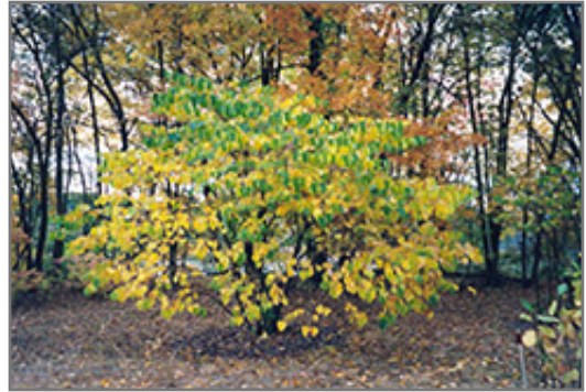
Northern Strain Redbud in fall

* This is a 'special order' plant - contact store for details