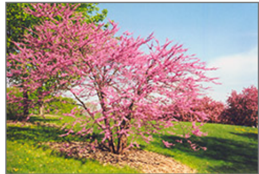
Northern Strain Redbud in bloom