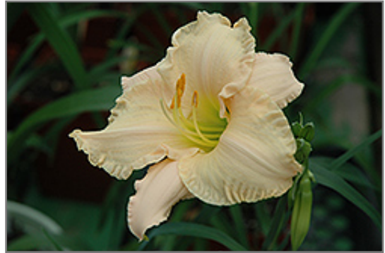
Lullaby Baby Daylily flowers