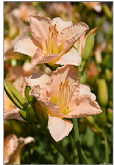
Lullaby Baby Daylily flowers