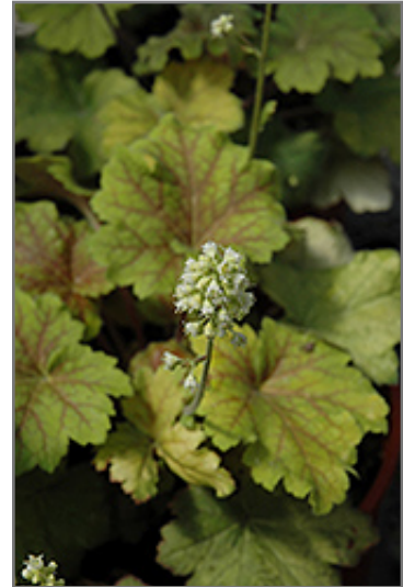
Electra Coral Bells flowers

Electra Coral Bells is recommended for the following landscape applications;