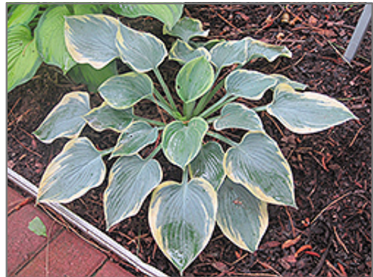
Aristocrat Hosta