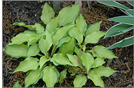
Cracker Crumbs Hosta

Cracker Crumbs Hosta is recommended for the following landscape applications;