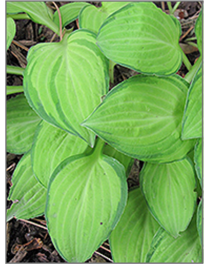
Emerald Tiara Hosta foliage

Emerald Tiara Hosta is recommended for the following landscape applications;